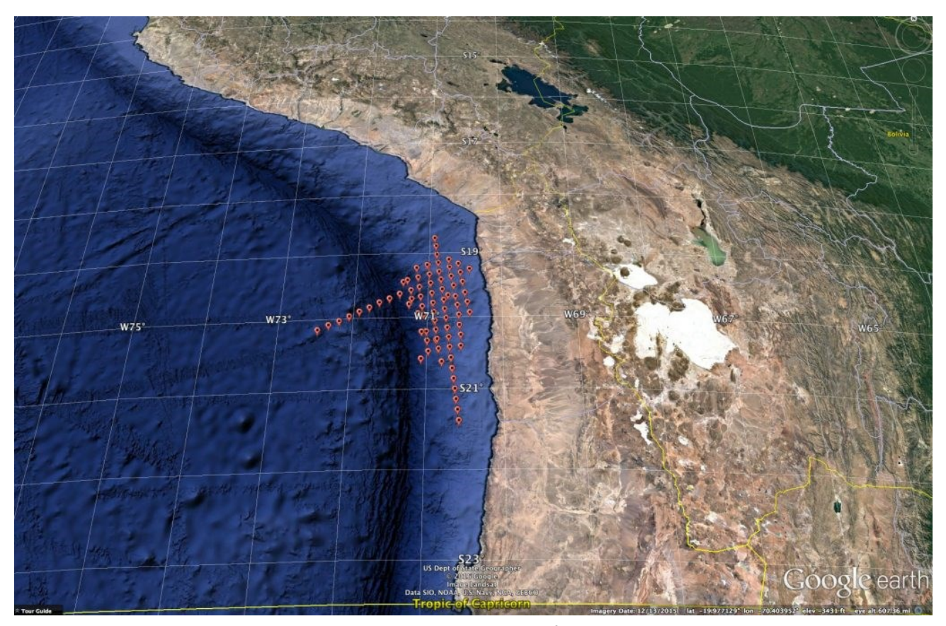
Proposed OBS deployment locations from cruise blog.

Experiment Summary: ... During phase 1, imaging will target the region that slipped during the 2014 earthquake and acquire reconnaissance data from the remaining gap to optimize the field program for phase 2. Earthquakes recorded by this and other OBS and onshore arrays will be incorporated into the data set for 3D tomography to increase the depth extent of imaging and improve determination of S-wave velocities and Poisson's ratio. Partners in this project include Oregon State University, GEOMAR, and the Universidad de Chile.